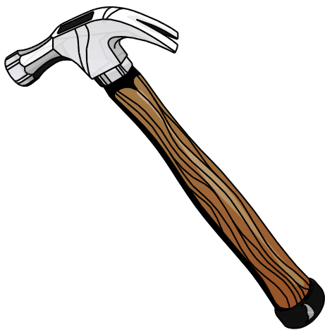
Figure 2. MILSPEC-grade kinetic fastener-embedding tool.

Because FERIC has not yet secured funding for the development of a working prototype, all cost and productivity calculations were performed using FERIC's Interface software. Based on the assumption of a materials consumption cost of more than $50 per tree for felling, delimiting, and chipping, the prototype would be substantially more expensive than the harvester-DDC combination. However, this cost analysis relies on retail pricing for limited-availability, proprietary consumables. Given the standard cost of $500 U.S. for a government-issue, MILSPEC-grade kinetic fastener-embedding tool (Figure 2), which would be available for less than $10 from public providers such as Canadian Tire (a 50-fold difference), substantial cost reductions are foreseeable once the M60 enters commercial production and a range of manufacturers begin competing for sales.